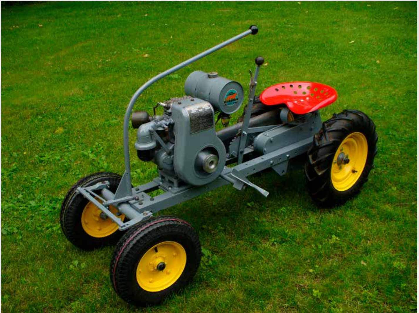
This photo shows the restored original prototype as it looks today. This machine is part of Al Lewis' Beaver tractor collection.

It showed up on the prototype unit as just "BEAVER." The words "garden tractor" were later added. Later yet, the name on the tractor was changed to "BEAVER riding tractor."